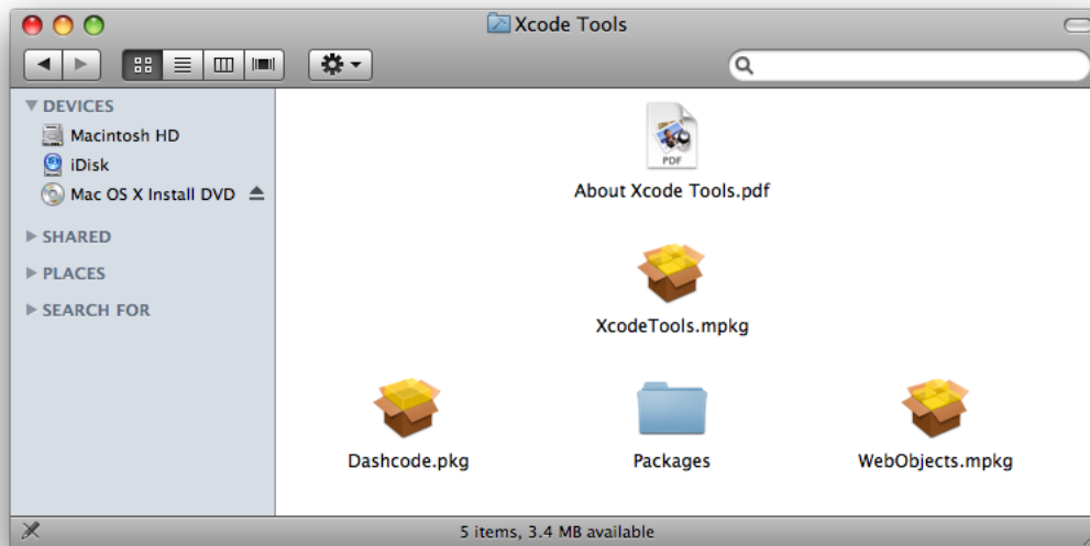
Figure 1-1 Xcode Tools disk

The Xcode Tools disk includes a set of UNIX developer tools, which include GCC, GDB and others. An Xcode installation contains a <Xcode>/usr directory with these tools. To support traditional UNIX-based development, you have the option of installing a second set of the UNIX developer tools in /usr . By default, this option is selected. You can also modify your shell environment to use the Xcode-provided UNIX tools.